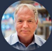
Sir Michael Houghton Chief Scientific Officer, API