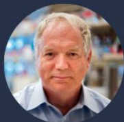
Sir Michael Houghton Chief Scientific Officer, API