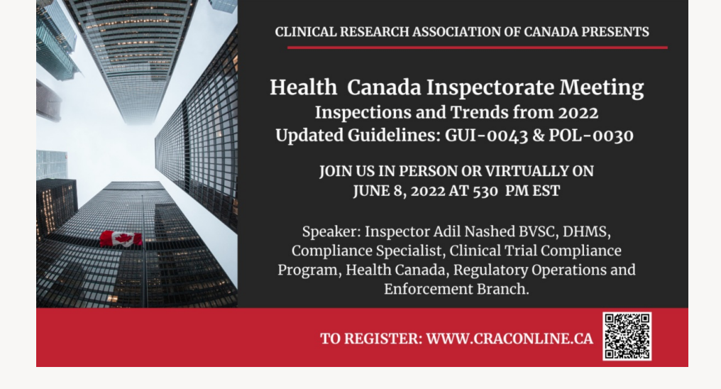
June 8, 2023