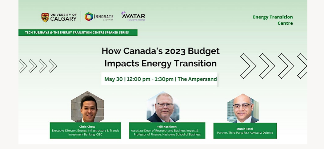
May 30, 2023