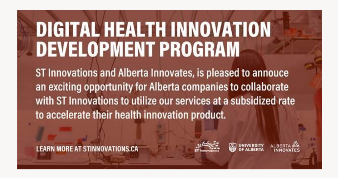
June 5, 2023